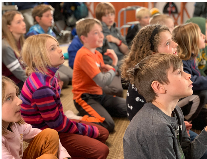
Feeling the music of our bodies