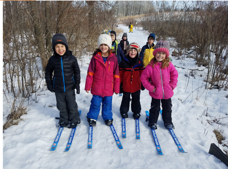
Putting new skills into practice