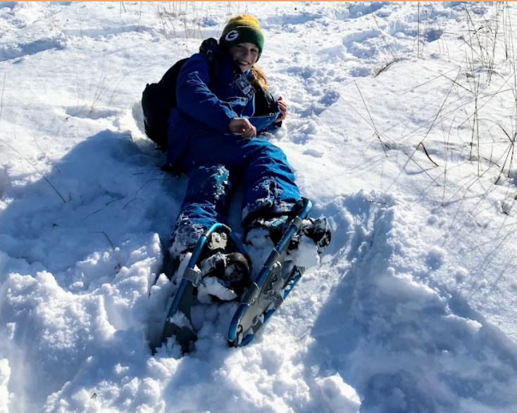
Taking a break from snowshoeing