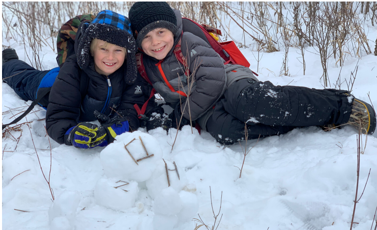
Working together to build water molecules