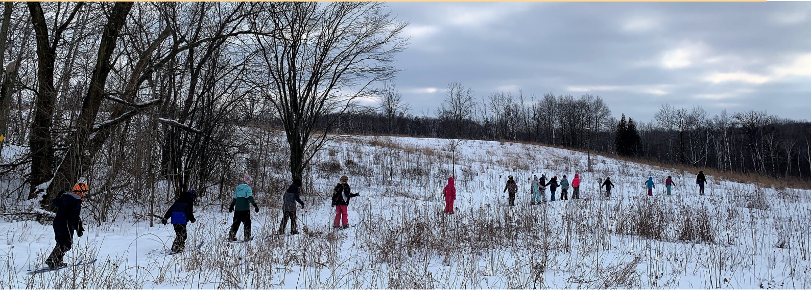
Cross country skiing across the prairie

The Official Newsletter of The Riveredge School