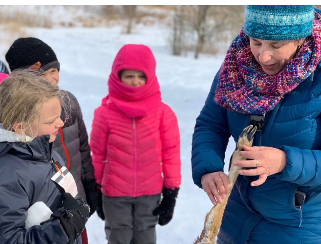
Getting a close look at deer adaptations