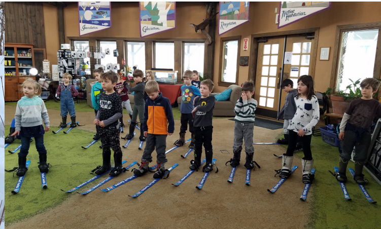
Learning how to XC ski on carpet