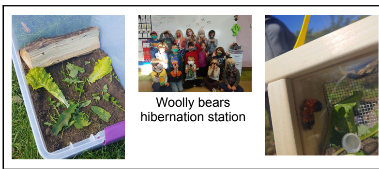
Woolly bears hibernation station