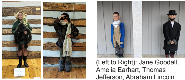
(Left to Right): Jane Goodall, Amelia Earhart, Thomas Jefferson, Abraham Lincoln

Third grade has been hard at work on their informational writing pieces, creating biographies of influential people in history and science. Students picked someone they were interested in and became an expert on them by reading and researching in books and online. They spent many class periods taking notes on their person's life and accomplishments, and then transferred those notes into their biography drafts. Each third grader then created a speech with the most important information about their influential person, and practiced it many times. Finally, we were ready to open our wax museum where students WERE the exhibits! Each third grade student embodied their hero with costumes and props, and we were joined by family members and the second and fourth grade classes. The third graders should be so proud of themselves for all the hard work they put into this project and for pulling off such an awesome wax museum! Thanks to everyone who came to help us celebrate all their hard work.