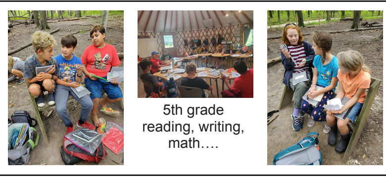
5th grade reading, writing, math....

This week was filled with starting our writing process by coming up with ideas using connections to stories, items from our homework assignment and creating a story map of memories. We've begun to dig into our first math unit. Having now learned more about the kids and receiving the results of the first pre assessment our math classes are going to look a little different next week as we start small group stations rotations. It will include more direct instruction, independent work and chance for kids to work on improving skill areas needing improvement.