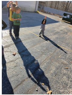
(above) Navigating with sound only. (left & right) Shadows & shapes.