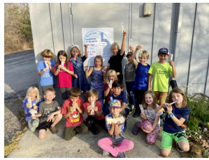
(left & above): Building insulators to keep popsicles cool. (right): Favorite color letters.